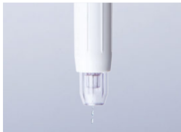
Prime the needle.