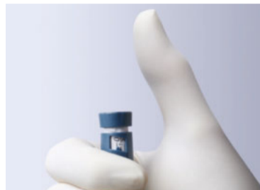
Grip pen in palm of hand and keep thumb up.

The first safety pen needle offering protection at both the patient and the pen ends