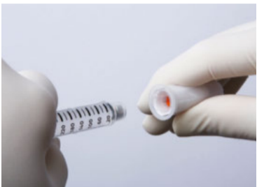
Attach the needle.